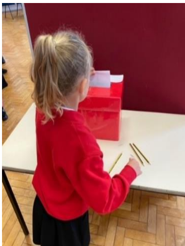
School council polling station