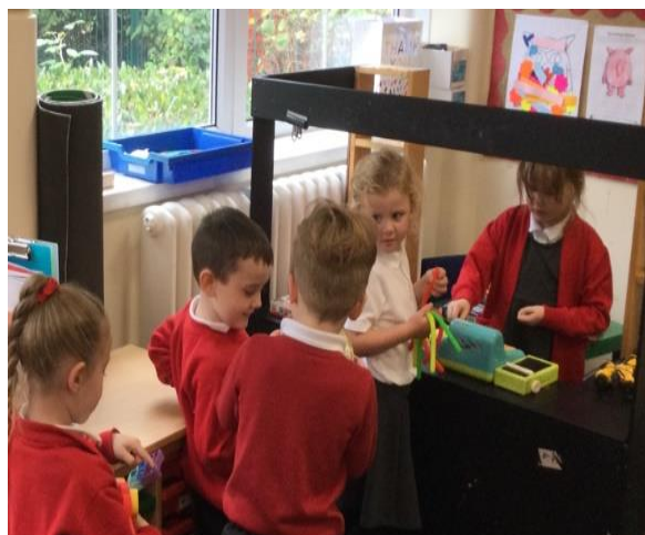
EYFS role playing shops and learning about everyday routines.