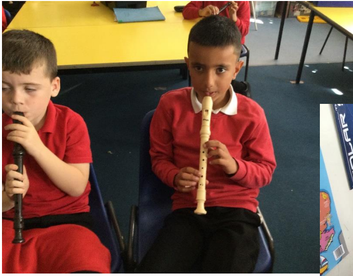
Recorders in Year 3

music an important part of their lives whereby they can strive to use and enjoy it however they wish to as they grow.