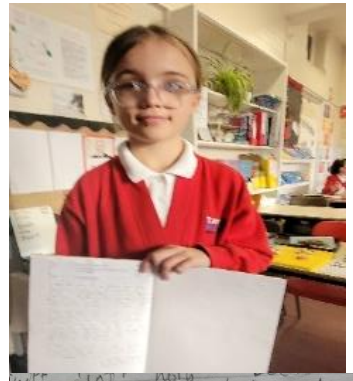
Year 4 Unit Madonna and Child