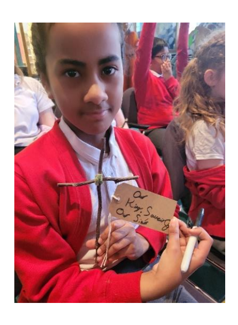
Year 5 Unit Salvation